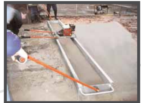
CAPABLE OF SCREEDING AREAS UP TO 7.2 METERS