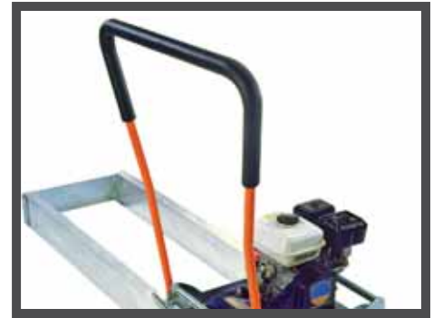
LOW HAND-ARM VIBRATION COMFORT HANDLES