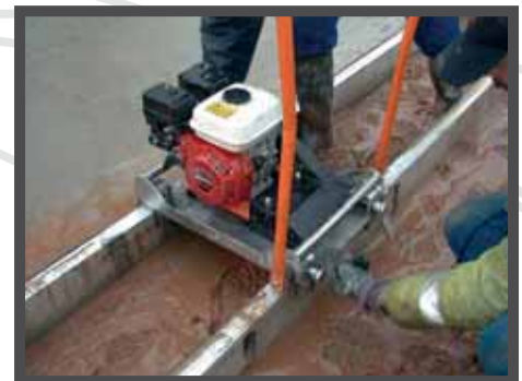
'QUICK CLAMP' SYSTEM FOR TOOL FREE ON SITE ASSEMBLY